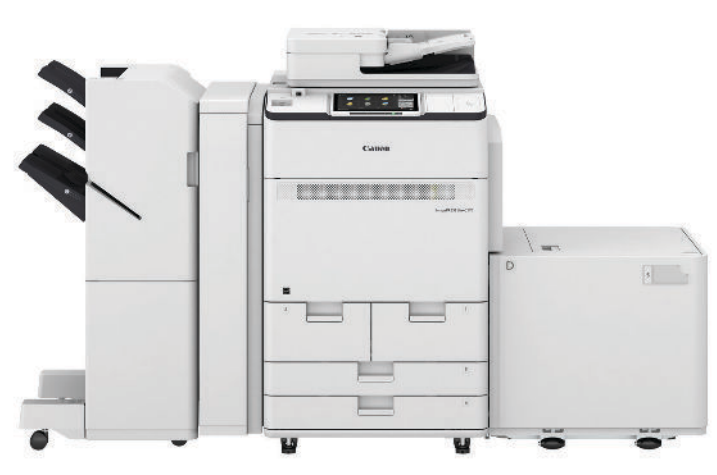
imagePRESS Lite C270 shown with optional accessories