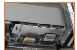
Staggered Dual Print Heads

MUTOH's genuine VerteLith RIP software bundled with FlexiDESIGNER MUTOH Edition 21 optimizes the VJ-1638UR Mark II through these key features: