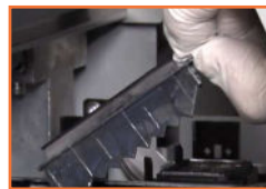
Replaceable Print Wiper