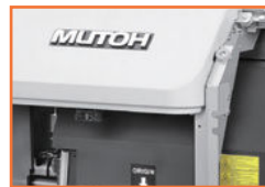
Easy Access Maintenance Panel