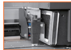
Automatic Media Cutter