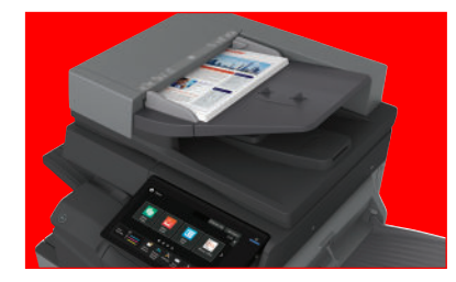
100-sheet RSPF scans documents at up to 80 images per minute.