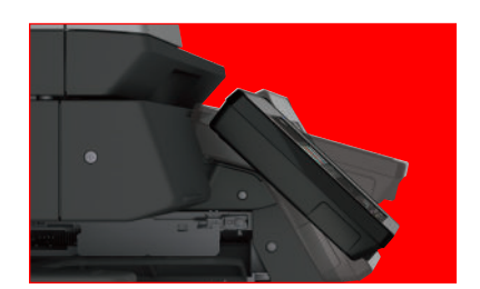
Pivoting Touchscreen offers the viewing angle for any use instantly.