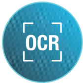
Optical Character Recognition

Higher Duty Cycles and Periodic Maintenance Intervals provide greater volume with fewer routine service calls so you can stay focused on productivity.